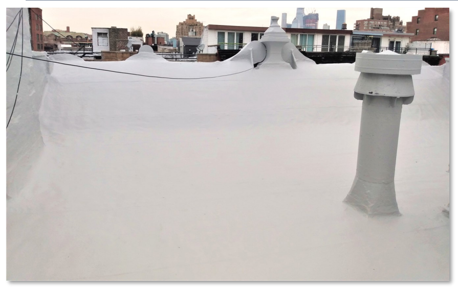
A full fabric, 45mil system creating a seamless, flexible, renewable membrane