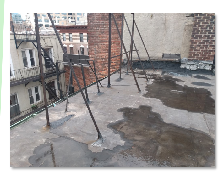
Acrylabs Asphalt Emulsion applied to all low spots

One of many worn and leaking roofs in NYC that was saved with the Acrylabs system by avoiding a costly tear off. With the use of the Acrylabs products, this roof no longer has ponding water, no leaks, and stays cool, saving up to thousands of dollars on energy bills.