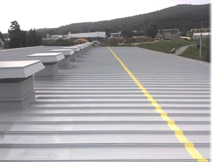
Can be used as a caution stripe at roof edges to provide a highly visible warning at the most hazardous areas of a roof