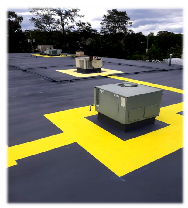
Provides a highly visible path

High strength Acrylabs coating combined with a recycled rubber aggregate to provide protection and slip resistance. Easily applied with a roller-no mixing required. Adheres well to Acrylabs membranes, as well as most existing roof surfaces.