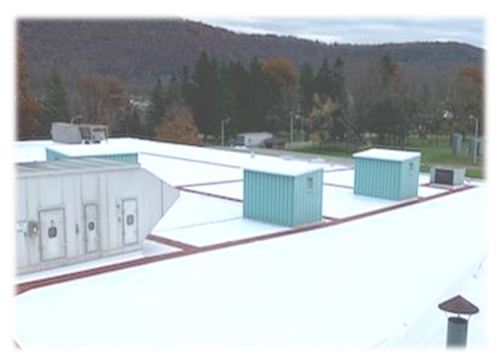
Identifies and protects walkways