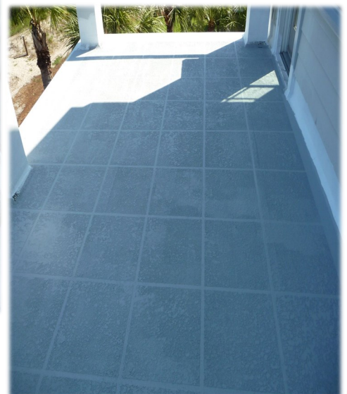
Two coats of Acrylabs DEK-coat finish applied