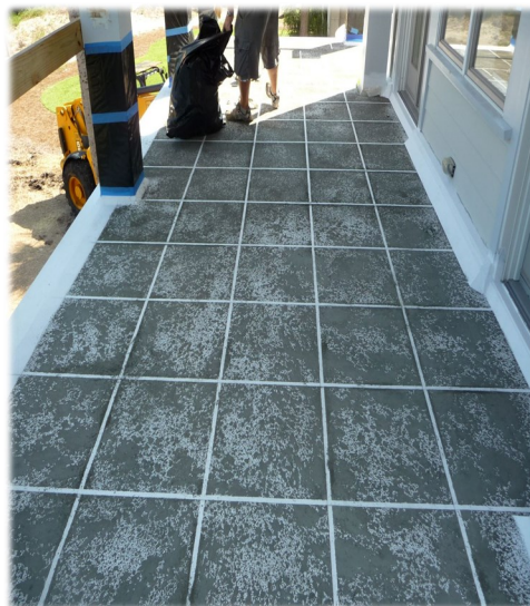
Acrycrete splatter technique knocked down with bull float