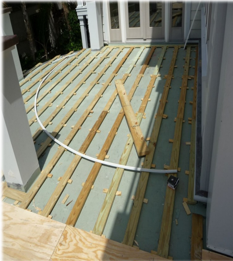
Installing new deck system over old deck

This project was completed by a more experienced crew working with Acrylabs Acrycrete and DEK-coat. The damaged deck was recovered with lath board and 3/4" T & G plywood. Seams were stripped with 4" fabric then the Base System was installed.